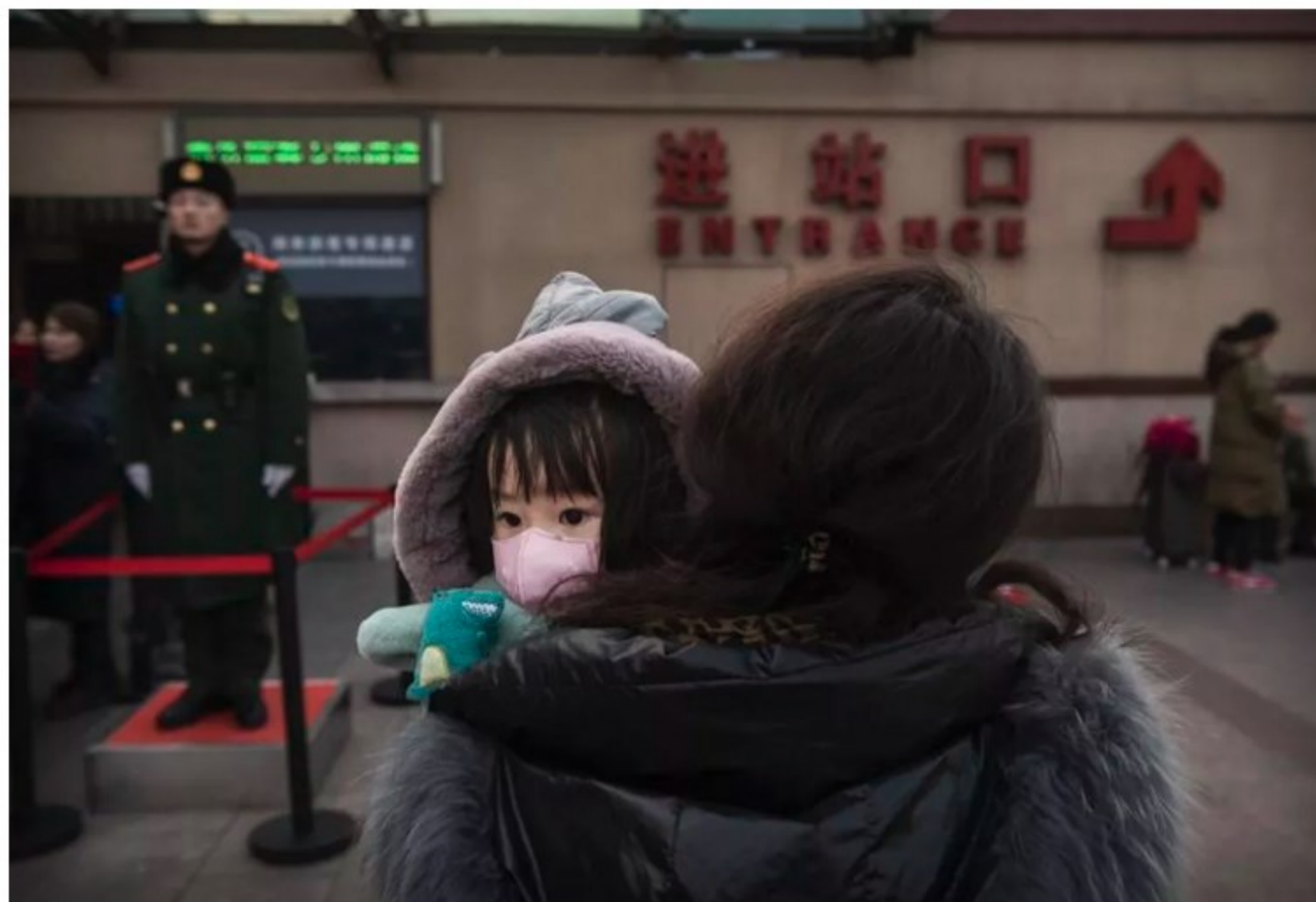
A Chinese girl wears a protective mask as she and her relative wait to board a train at Beijing Railway Station in January.